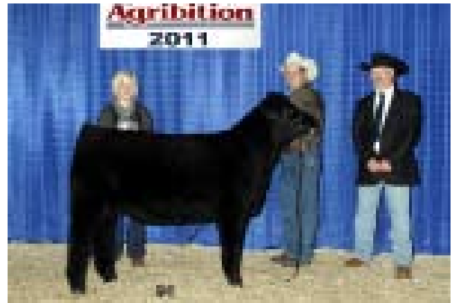
Fairland Black Pearl 41Y Exhibited by Fairland Cattle Co., Penhold, AB

Premier Breeder & Exhibitor Hall's Cattle Co., Craven, SK