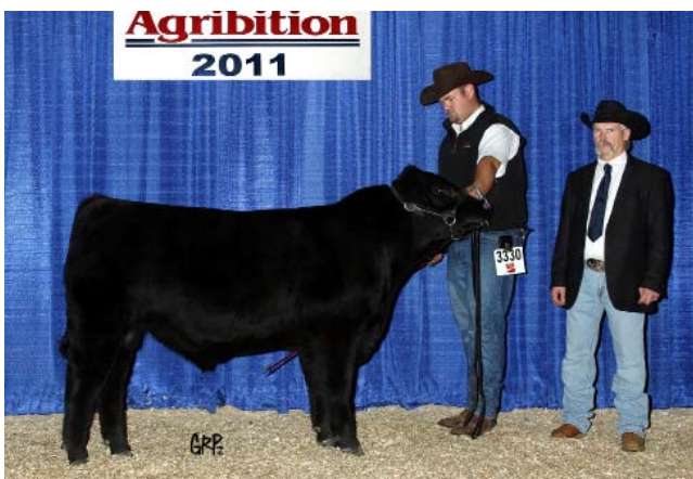
DRSS Crossing Waves 20Y

Exhibited by Dun Rite Stock & Stable, Bentley, AB