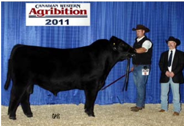
Hall's Crossing 454W Exhibited by Dun Rite Stock & Stable, Bentley, AB