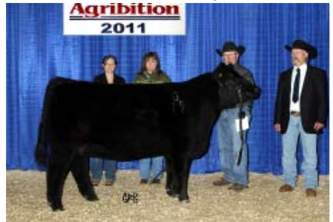
Hall's Miss Xaria 019X

Exhibited by Hall's Cattle Co., Craven, SK