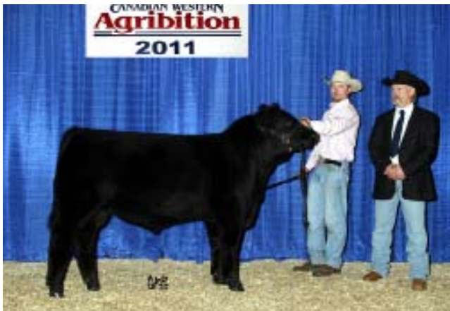
Hall's Sir Chauffeur 80Y

Exhibited by Hall's Cattle Co., Craven, SK